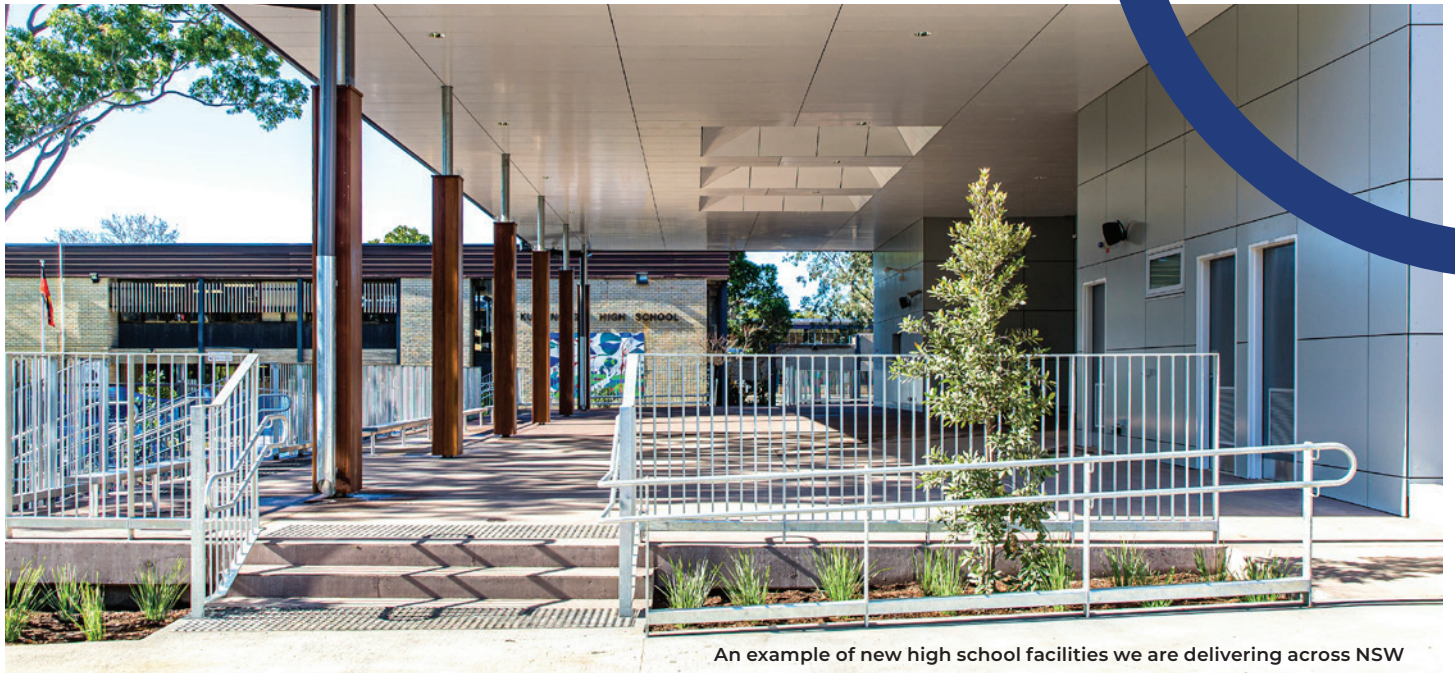
An example of new high school facilities we are delivering across NSW