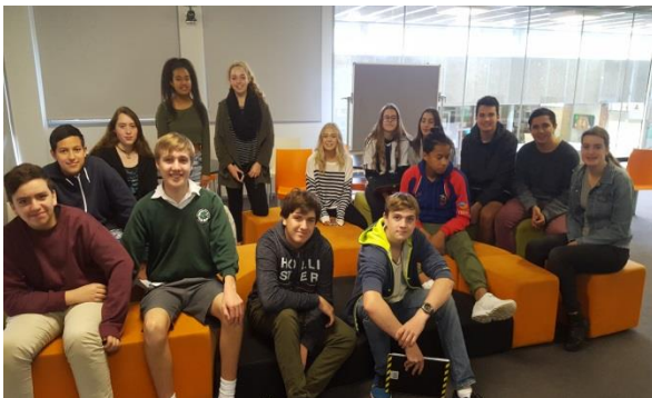
Year 9 Forest High School Geography Class