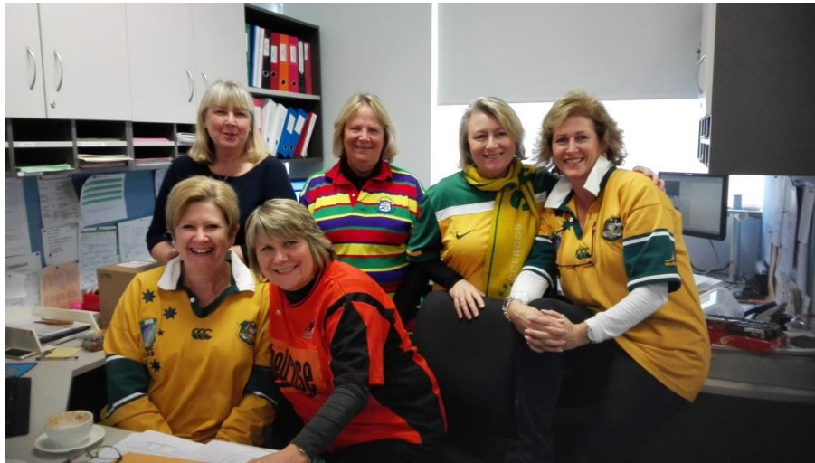
SASS Staff in Mufti team colours in support of Cancer Research

number to advise the school of an upcoming absence. Please advise the school of any student absences by phone or in writing to the office. Please do not advise the teaching staff. Thank you.