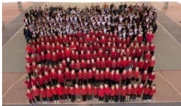
Entire student cohort and staff from Lightning Ridge Central School